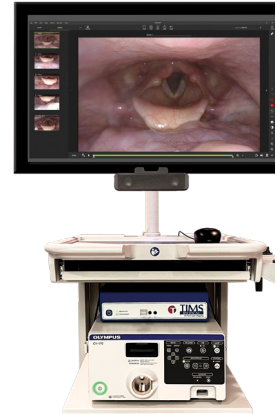
TIMS MVP integrated onto an Olympus endo stack.

Most TIMS systems for FEES can be installed and trained remotely with online and phone assistance from our expertly trained TIMS Medical staff. In the event that onsite installation is desired, it can be quoted by your sales representative.